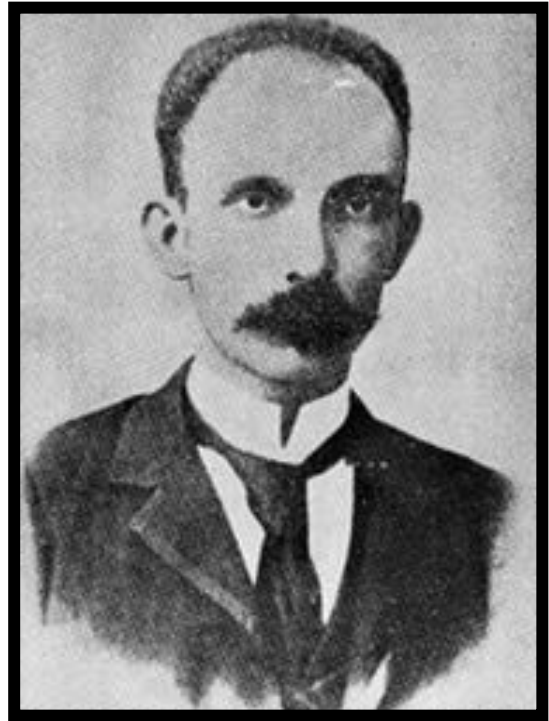
JOSE JULIAN MARTI [1853-1895]

Abraham Lincoln was one of the truly great men of all time. He preserved the American Union during the Civil War and proved to the world that democracy can be a lasting form of government. Lincoln's "Gettysburg Address" and many of his other speeches and writings are classic statements of democratic beliefs and goals. Lincoln was the first President elected by the Republican Party. His great asset was his ability to express his convictions so clearly, and with such force, that millions of his countrymen made them their own. His great source of strength was his iron will. Life in the United States during Lincoln's administration revolved almost entirely around the Civil War. To raise money to fight the war, Congress levied the first income tax in the history of the country. An assassin's bullet ended this great man's life in 1865.